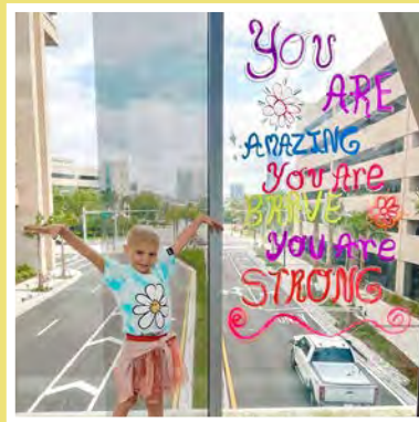
Windows painted for Nurses Week