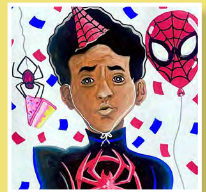
Birthday posters painted for patients