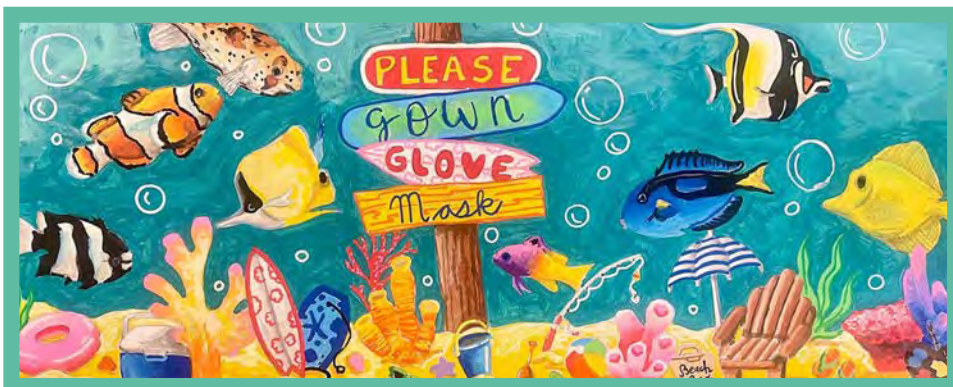
Banners painted for patients receiving transplants

Nobody wants to celebrate their birthday or spend holidays in the hospital. Thankfully, art is like a superhero, ready to save the day! It can put a smile on patients' faces, giving them something to look forward to when times are tough.